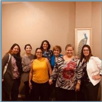
Deltona WVHA staff and our friends from Family Health Source.

For the past four years, our West Volusia Hospital Authority staff have assisted people in applying for health care benefits. This consisted of helping clients understand and gather the required documentation to prove eligibility, reviewing the completed application to assure it was complete and met all requirements, and then submitting the application to a third party for approval. The House Next Door was excited to take on a new role for the Authority. As of January 1, 2019, The House Next Door assumed the approval process. On Wednesday, January 30, our Deltona West Volusia Hospital Authority staff held an open house in their new offices at 840 Deltona Blvd., Suite W. We had a wonderful turn out!