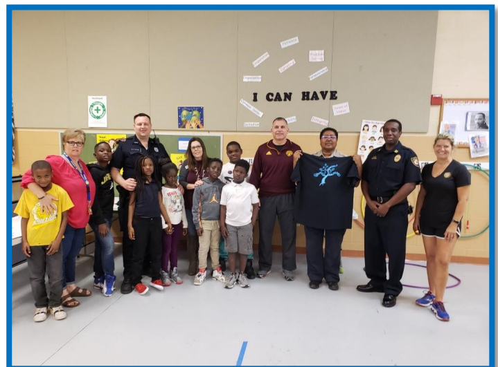
Celebrating Martin Luther King Day with the kids at The Homework Club and our community partners from the DeLand Police Department.